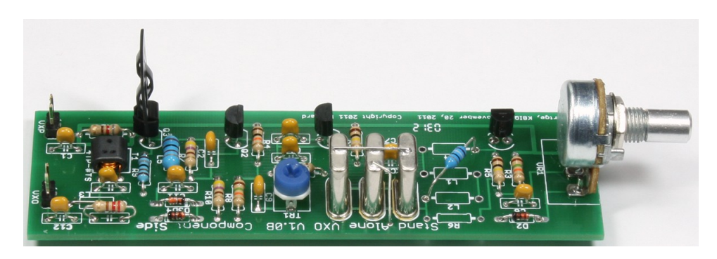
The 220 Ohm resistor used in the NS-40 option is the one shown just to the right of C12.

The SAVXO has two build options available. When built to drive the NS-40 transmitter, the SAVXO has a 220 Ohm resistor across the output to properly load the NS-40, so that it is stable and can run without a crystal. Below is a photo of the SAVXO with that option shown.